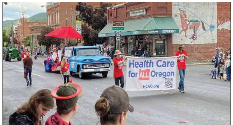
HCAO’s Union County Chapter stood up for healthcare in local parades and similar events.