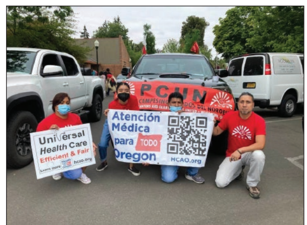
PCUN supports Health Care for All Oregon and Universal Health Care