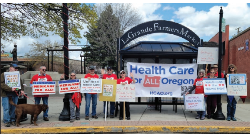
HCAO’s Union County Chapter supporting Universal Health Care at the La Grande Farmers Market