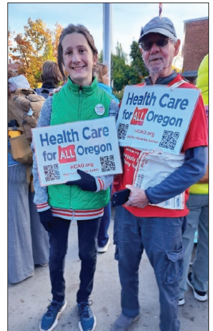
HCAO’s Lane County Chapter shows off its multi-generational support

H CAO knows the vast majority of Oregonians want universal access to healthcare. We know single payer is the only affordable plan to achieve this. We will continue engaging with individuals and communities statewide to change what we now have—a “system” that denies care. Healthcare transformation continues to be an uphill battle. HCAO and our allies must continue with a flexible strategy that strongly focuses on collaboration. To succeed, we must win the messaging battle with our opponents in Oregon and nationally. It won’t be easy, but it’s ultimately doable.